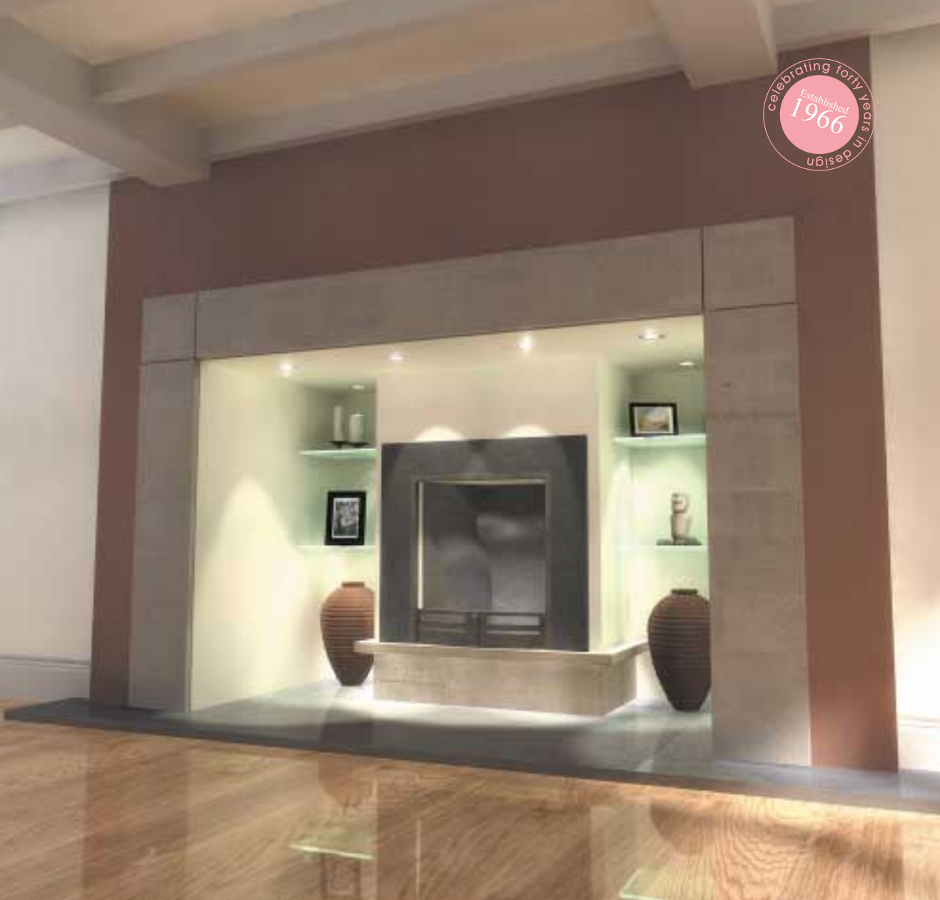
Initial concept design for Countryside Properties PLC